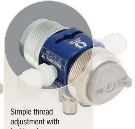
Lock ring and cap

Simple thread adjustment with locking ring