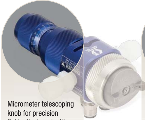
Ultra precision knob

Micrometer telescoping knob for precision fluid adjustment with numerical indexing for retainable adjustment settings